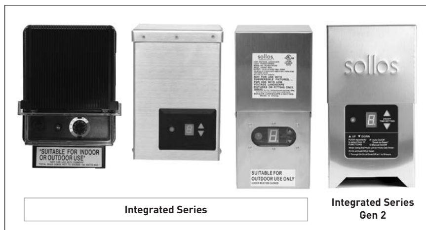
Pool and Spa Light Transformers